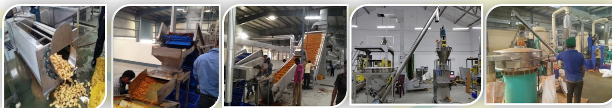
Industrial Processing: Washing> Slicing > continuous band drying >Pulverizing > Vibratory Sieve